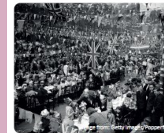
Street party to celebrate the coronation.