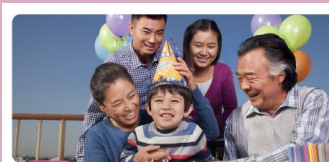
Birthdays happen every year.

Important life events include birthdays, religious festivals or family celebrations. Some life events happen every year, and some happen at certain stages of human life.