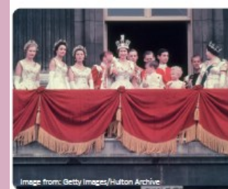
Queen Elizabeth II on her coronation.