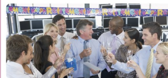
Retirement happens when an elderly person leaves work.